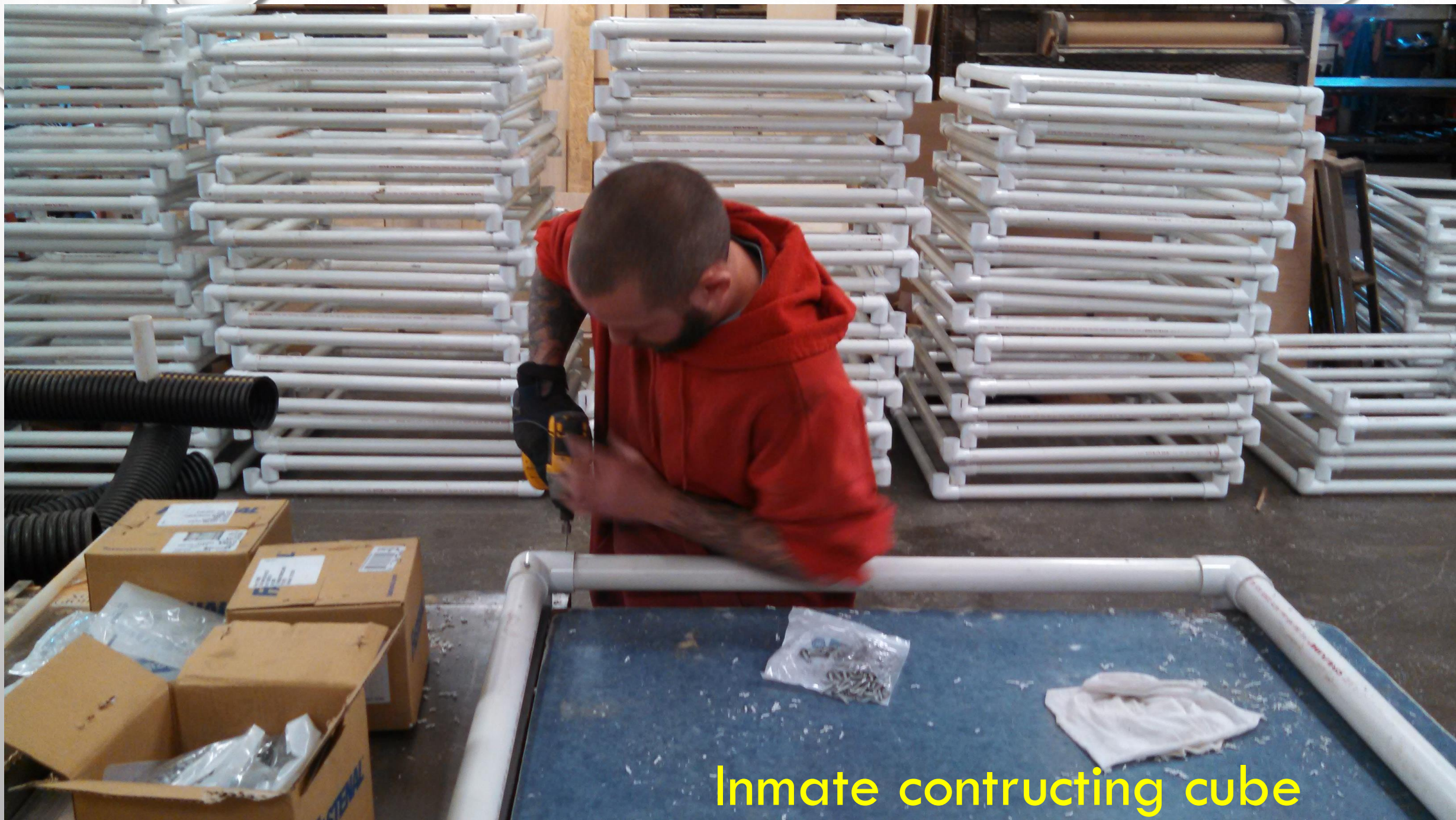
Inmate constructing cube