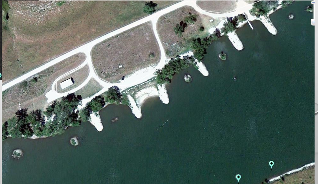
Chase State Fishing Lake 1985 and 2011.